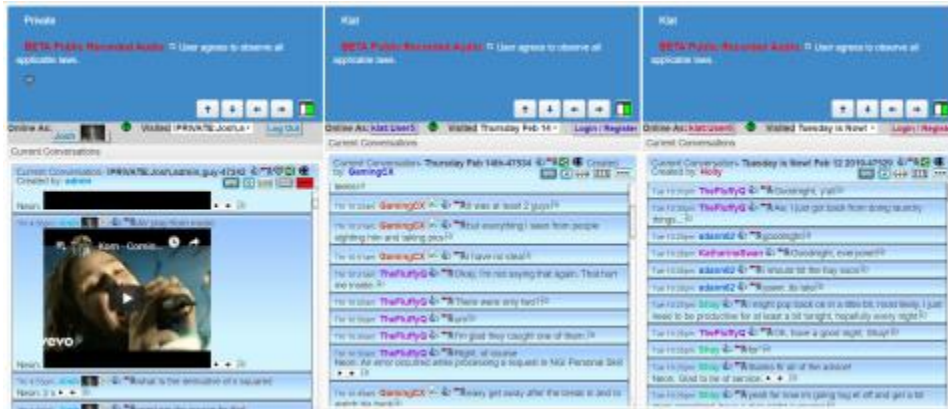
klat.com Three Column Chat

New Conversation Processing Intelligence (CPI) Tools Integrate: Online Conversations, Realtime Speech-to-Text, Realtime Text-to-Speech, Automated Translation, Automated Conversation Sharing, Database Lookup and AI Skills KLAT.COM